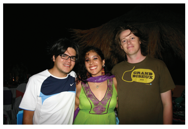
Fig 1. Cancun workshop organisers.

The foundation of the Iberoamerican Society for Bioinformatics (Sociedad Iberoamericana de Bioinformática, SolBio), within the RIBio Annual General Meeting.