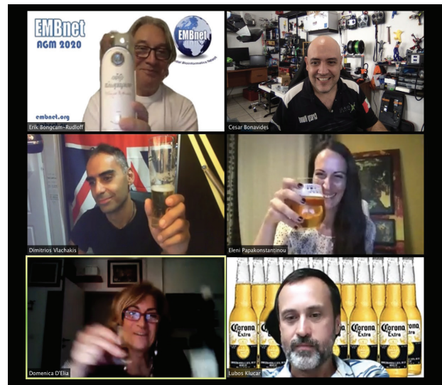
Figure 2. The survivors toasting at the success of the EMBnet Conference and of the AGM 2020.

activity reports, the presentation of the latest achievements and plans for the EMBnet Journal and the discussion on priorities and plans for 2020/2021. A virtual toast among some of the Operational Board’s members (Fig. 2), survived at the intense last day activities, the success of the Conference and the pleasure to stay all together again, although geographically separate, with the wish that in 2021, EMBnet members can meet again in person to exchange true hugs that have been missed so much to all us.