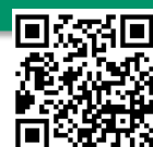
Figure 1. GOBLET's first poster, accepted in the new education track for ISMB2013 posters.

Global Organisation for Bioinformatics Learning, Education & Training