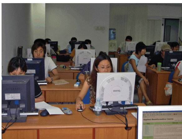
Figure 1. The students are doing hands-on practice in the training room of the ABC course.

The course is designed for biological graduate students to solve practical problems. After a brief introduction to the three most popular bioinformatics resources, the National Center for Biotechnology Information (NCBI), the European Bioinformatics Institute (EBI) and the Expert of Protein Analysis System (ExpASY), the students are happy to start with hands-on practice, to retrieve the alpha subunit of human, mouse and rat hemoglobin from Swiss-Prot, then make comparison of the amino acid sequences between each other [Swiss-Prot: HBA_HUMAN, HBA_MOUSE, HBA_RAT]. Couple of online web servers can be found from the links at ExpASY, such as the built-in