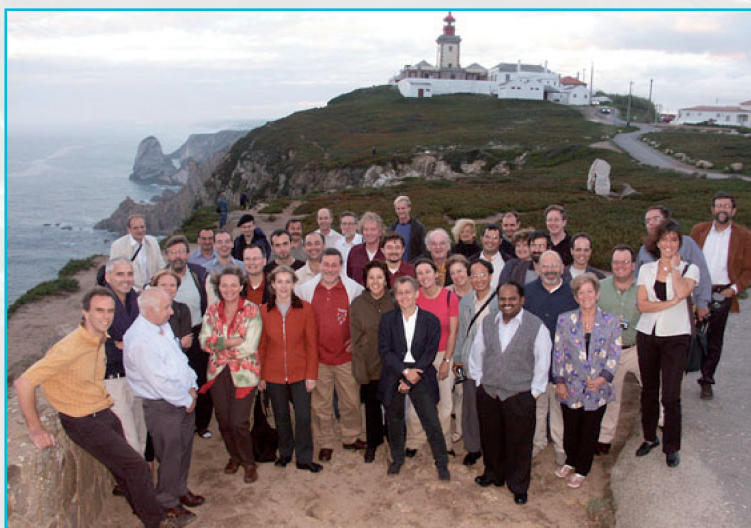
Figure 1. Cooperation on the edge. Participants in the EMBnet AGM 2002 end a day of meetings at the most western tip of continental Europe, Cabo da Roca, Portugal.

The 1990 scenario sounds distant now. We have experienced different technical challenges in the last 20 years. Daily updated databases are now commonplace. So is the availability of Bioinformatics services on the WWW. In the meantime, many other important steps could be given. EMBOSS sprang-up