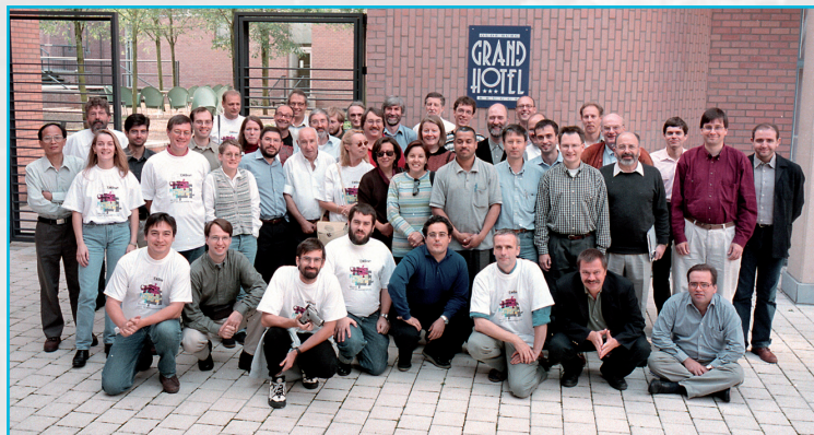
Figure 3. 1999, EMBnet AGM in Brugge (BE)

This and subsequent grants have been important for the success of EMBnet. The initially intended purpose of EMBnet was fulfilled. During its first 6-8 years, the national nodes were the centres where researchers in each European country could access bioinformatics data that were kept in perfect synchrony with