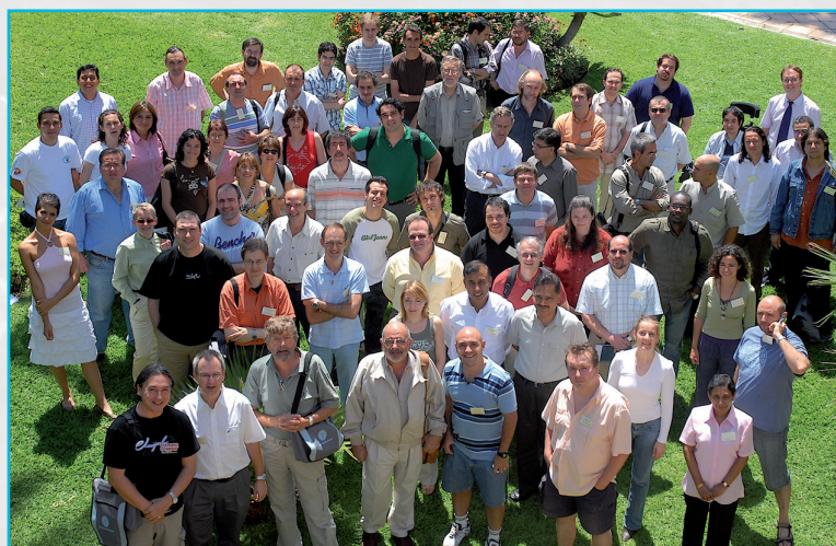
Figure 5. 2007, EMBnet AGM in Torremolinos (ES). Join Meeting EMBnet - RIBIO "Bioinformatics 2007: Workshop on Collaborative Bioinformatics".

EMBnet produces information and guidance in biocomputing by publishing support