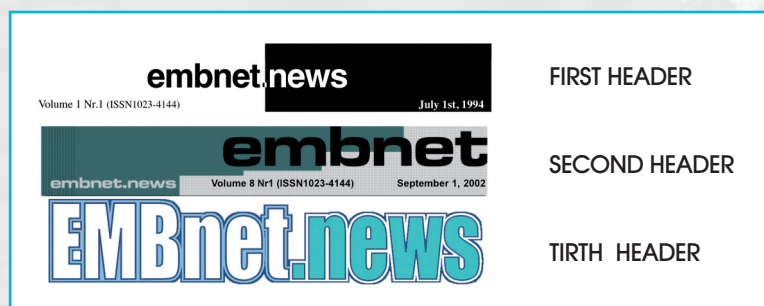
Figure 1. The figure reports the 3 historical headers of the EMBnet.news

recollect lost past issues. Various successful series of articles were appreciated by the readers, e.g., BITS (Bioinformatics Theory Section) and INTERviewNET, that contributed a lot to the popularity of the newsletter. However the good days were gone, in 1999 the crisis began together with EMBnet funding issues. Until 2002 only one issue per volume was published and even a complete absence of any issue in 2001. Their last issue 8.1 in September 2002 was coincidentally the first in color.