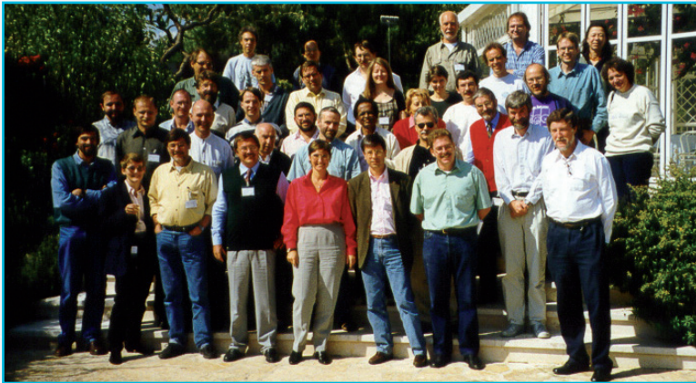
Figure 2. 1997, EMBnet AGM in Bari (IT)

tion. Computer cluster technology got widespread acceptance much later.