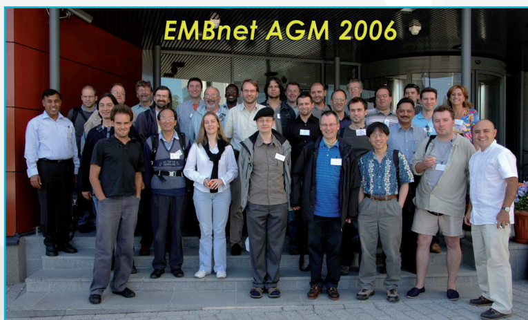
Figure 4. 2006, EMBnet AGM in Scandinavian countries (Uppsala - Sweden and Helsinki - Finland)

the central data repositories at EMBL and its corresponding agencies NCBI at NIH in the USA and at DDBJ in Japan. Data communications improved. The Data Library function at EMBL was transferred to its outstation, the European Bioinformatics Institute (EBI) at Hinxton (UK), that was established in 1993.