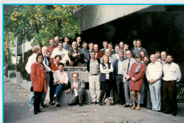
Figure 1. 1993, EMBnet AGM in Basel (CH)

The 20 th century brought us an enormous growth of knowledge in the field of life sciences. Research on nature's methods to code, store and translate genetic information into biological