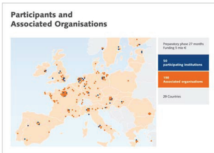
Figure 3. BBMRI Participants and associated organisations. Participants are co-applicants of the project and full members. They have an official vote on formal issues in the Governance Council that is responsible for the definition of the appropriate strategy and processes, and is required for the approval of reports and any changes of the work plan. Associated Members do not have an official vote, but they receiving all relevant information on BBMRI (e.g. forthcoming events, achievements, media reports) and they have the right to participate in several activities, such as Work Package meetings and the BBMRI Governance Council meeting.

providing best practice-based protocols for molecular analyses of different types of samples. Key to any large assembly of data, be it biological, clinical, epidemiological, or behavioral, is the system for information management. WP5 coordinates and supervises all processes of the IT, informatics and infrastructure in the project. Success has been made in finding consensus on a general information management system for maintaining unique and secure coding systems for specimens, subjects and biobanks. WP5 has initiated a searchable BBMRI catalogue of disease-oriented biobanks together with WP3. The catalogue provides a high-level description of Europe's biobanks, including contact details, background and objectives, descriptions of available samples and data and the possibilities for access according to informed consent, links to the biobanks websites etc.