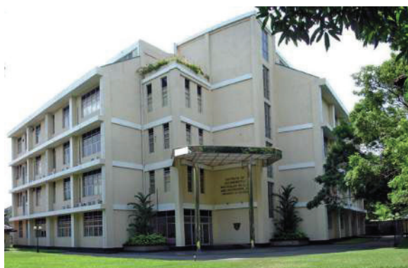
Figure 2. The IBMBB building.

Institute of Biochemistry, Molecular Biology and Biotechnology was first elected as the Sri Lankan national node in 2007. Since then we have managed to achieve several goals such as dissemination of knowledge through workshops and training programs and setting up resources in bioinformatics. Being the only institute of this kind in Sri Lanka we are aware of our responsibility to provide technical support and knowledge to Sri Lankan Molecular Biologists on using Bioinformatics tools for their research and to provide access to online databases and tools in bioinformatics.