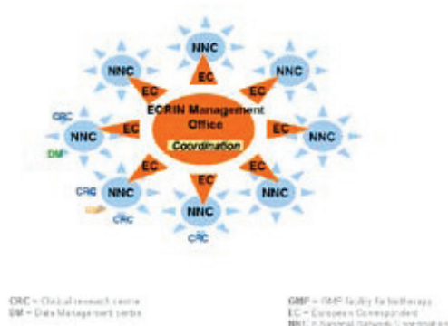
Figure 2: Organisation of the network

monisation and quality in European clinical research. Lancet 2005; 365, 107-108.