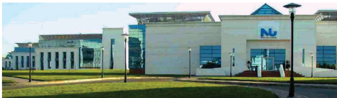
Figure 1. Nile University.

NUBIOS (Nile University Bioinformatics Server) is a web-based portal running over the existing computational infrastructure. The server was developed as part of an internally-funded research project conducted in collaboration with the Department of Computing at Imperial College London in the UK and the Practical Computer Science Department at Bielefeld University in Germany. NUBIOS hosts public and local biological databases. It also provides access through web and programmatic interfaces to a wide variety of popular bioinformatics tools and novel tools developed by Nile University. Beneficiaries