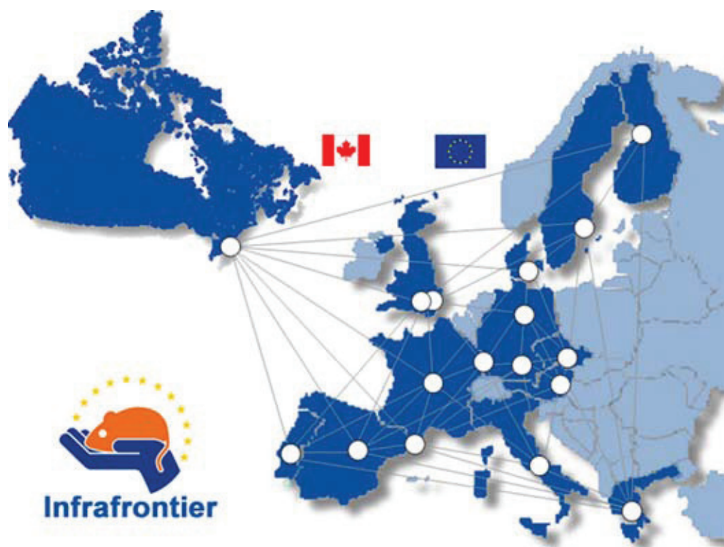
Figure 1. The members of the Infrafrontier consortium are phenotyping and archiving facilities as well as ministries, research councils and funding agencies in 12 European countries and Canada.